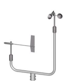
Traverse for Wind Transmitters "First Class" 4.3174.00.000

For mounting the wind speed transmitter and wind direction transmitter jointly onto a mast.