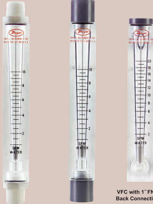
VFCII with 1" MNPT End Connections