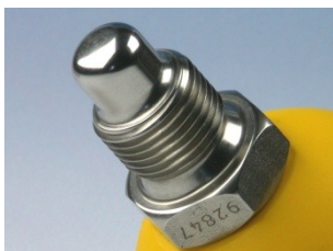
1/2" BSP thread Standard size