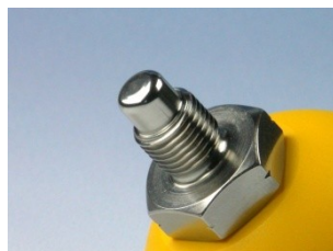
1/4" BSP thread For smaller pipe diameter

The flow-captor 412-.1- is available with different sensor head versions.