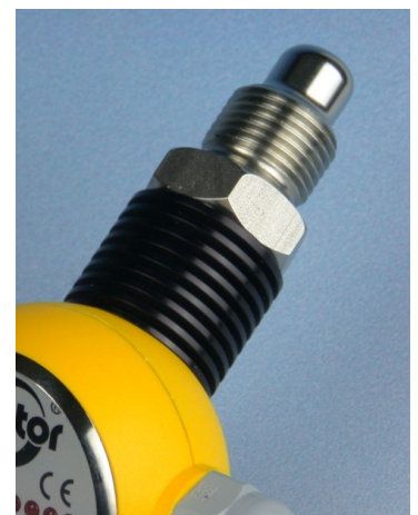
flow-captor 412-.1 S101

The housing is constructed of glass fibre reinforced PBTP (Ultradur ®). The electronics inside is completely epoxy resin encapsulated.